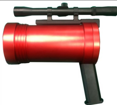
(In case of aiming at detector in hand-grasping)