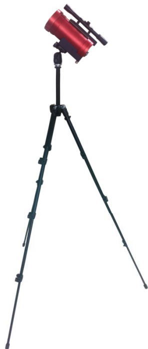
(in case of using the optional tripod)